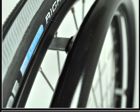
Tetra Grip push rim supersedes Foam coated.