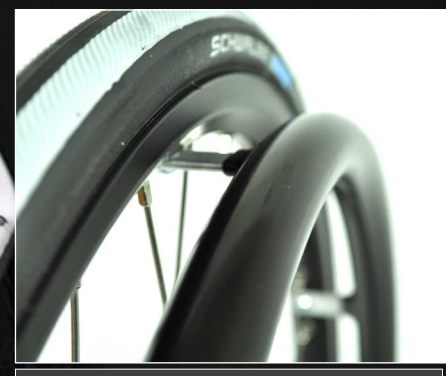
Para Grip push rim supersedes PRC.