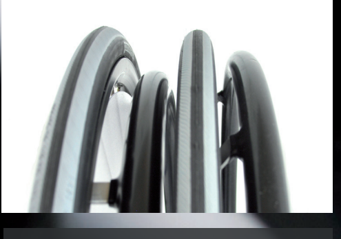
DIFFERENCE IN DIAMETER BETWEEN THE OLD PUSHRIM AND THE NEW TO THE RIGHT - 530 TO 560 MM

The benefits will be larger outer diameter, 560 mm, previously 530 mm, which gives easier propelling of the wheelchair. The new pushrims are mounted in the same way as the old and the measure between the tabs are the same. To be able to separate the new pushrims from the old they are supplied with BT (bent tabs) in the article number. You can still order the pushrims with straight tabs as long they are in stock.