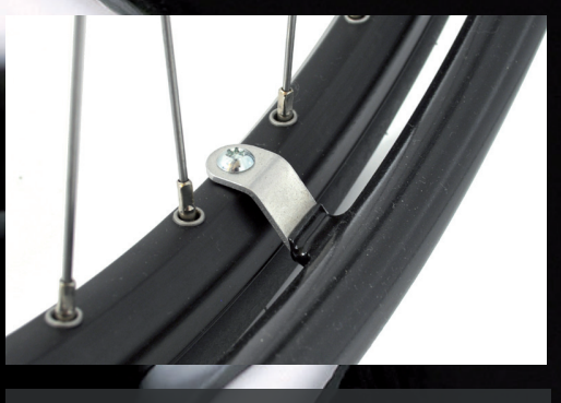
NEW PARA- AND TETRAGRIP PUSHRIMS WITH BENT TABS