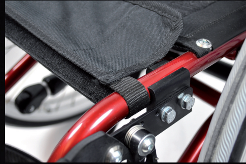
OLD BAMBINO SEAT WITH SHORT BAR

All standard Bambino seat will be upgraded with a new long bar where the seat extender is attached, the same design as the abduction seat. This implicate an easier and more accurate adjustment of the seat depth without interference of the brake.