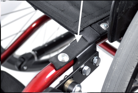
UPGRADED BAMBINO SEAT WITH LONG BAR