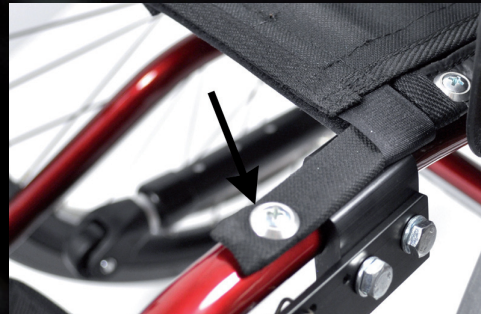
THE FRONT SCREW OF THE BAR

ON OLDER CHASSIS THAT LACKS THE EXTRA HOLE FOR THE NEW BAR, YOU NEED TO USE AN AWL TO MAKE THE HOLE. WATCH VIDEO