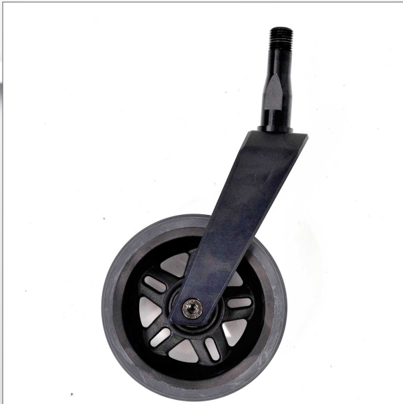
S3 CASTOR FORK WITH AXLE