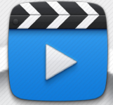
LINK TO DEMO VIDEO