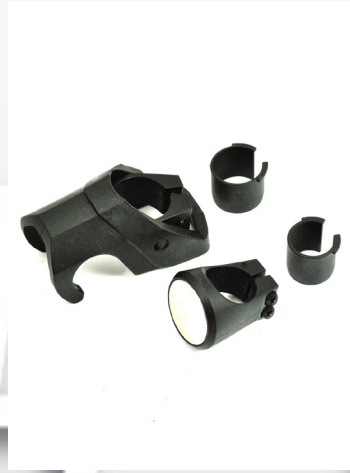
CRUTCH HOLDER S3