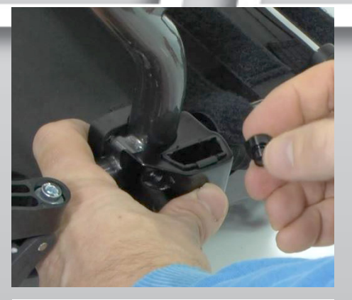
4) Place the threaded bushing on it opposite side.