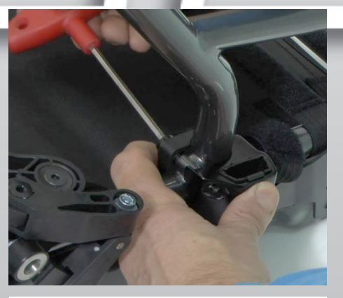
5) Tighten securely with a 4 mm Allen key.