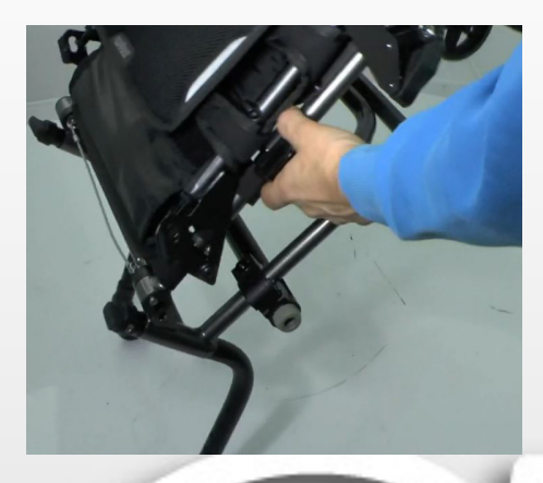
7) Turn the wheelchair over, into upright position.