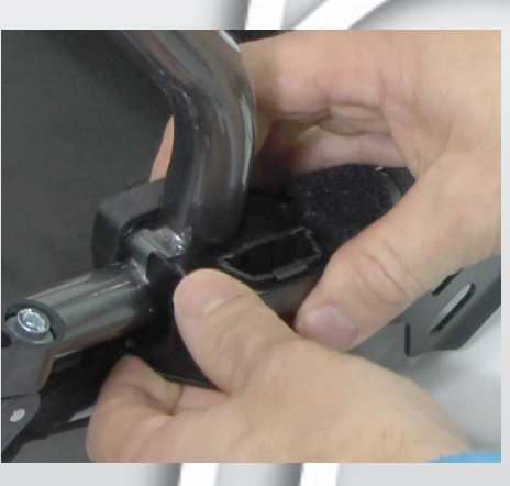
2) Put the bracket on the chassis as shown in the picture and close the bracket. See exploded view on page 3.