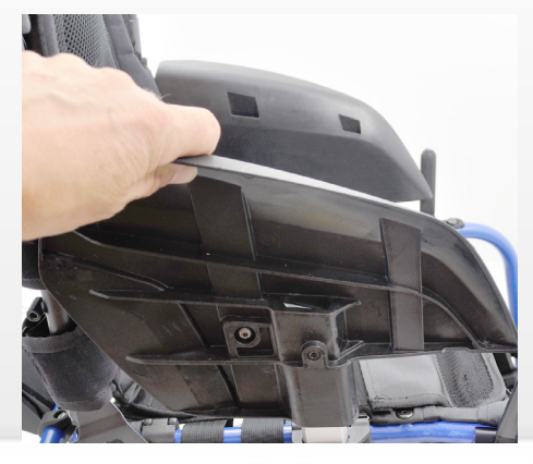
8) Then mount the side guard in the bracket. Repeat the procedure for the other side.