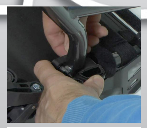
6) Take screw M5x16 mm. Put it in the other hole and tighten firmly with a 4 mm Allen key.