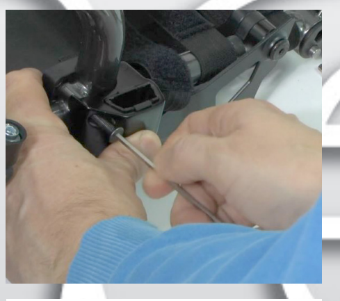
3) Fit screw M5x30 mm through the threaded bushing, welded on the chassis. Tighten with Allen key 3 mm.