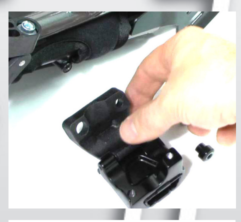
1) Remove the rear wheels and place the wheelchair upside down. Take one bracket, left or right.

Tools needed: Allen key 3 mm Allen key 4 mm